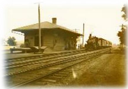
Avon Depot ca. 1900 Connecticut Digital Archive

The building stands today on the northeast side of Scoville Road next to the Farmington Canal Heritage Trail on private property. (Photo Connecticut Digital Archive).